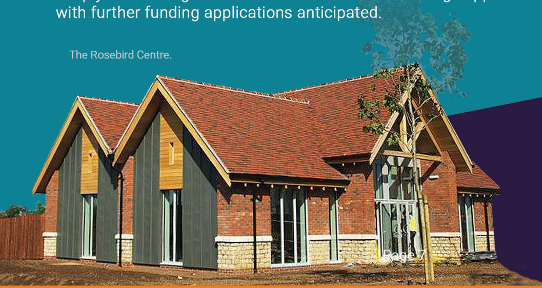
The Rosebird Centre.

These discussions also generated fresh ideas for securing additional support through joint funding bids. As a result, several centres have begun collaborating on the 'Community Anchor Project' - an initiative designed to develop community centres into central hubs of local support, rather than simply functioning as hireable halls. This work is being supported by the Development Officer, with further funding applications anticipated.